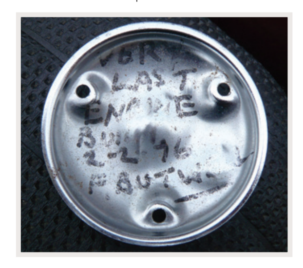
"Very last engine built 2-2-76 F. Butwell builder".

The most intriguing feature on CN 07203, however, was inside the points cover. Here was written in felt pen: